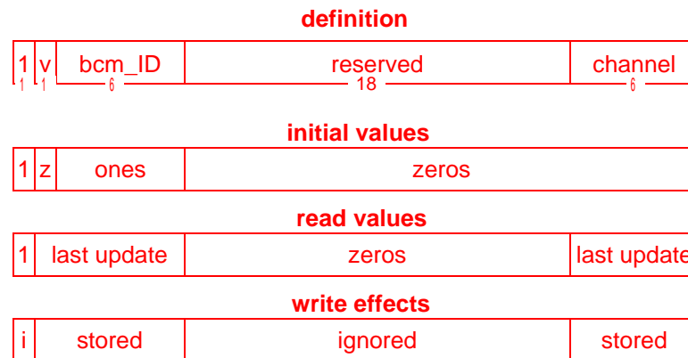
Figure 9-5—BROADCAST_CHANNEL format

The BROADCAST_CHANNEL register permits the broadcast channel manager to communicate the channel number assigned for asynchronous stream broadcast to other nodes on Serial Bus. This register also provides a mechanism used by the election protocol for the broadcast channel manager. The BROADCAST_CHANNEL register shall support quadlet read and write requests, only. The definition is given by figure 9-5 below.